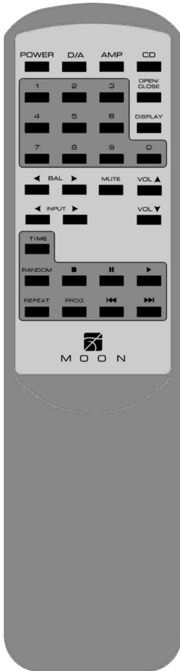
Figure 3: CRM-2 Remote Control

The MOON 220i Integrated Amplifier uses the ' CRM-2 ' full-function remote control (figure 3). It operates on the Philips RC-5 communication protocol and is can be used with other Simaudio MOON components.