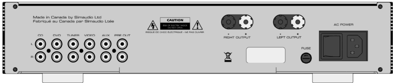
Figure 2: MOON 220i Rear panel

The rear panel will look similar to Figure 2 (above). There are five (5) pairs of single-ended inputs on RCA connectors labeled CD, DVD, TUNER, VIDEO and AUX. The left channel inputs are located on top and the corresponding right channel inputs are located directly below.